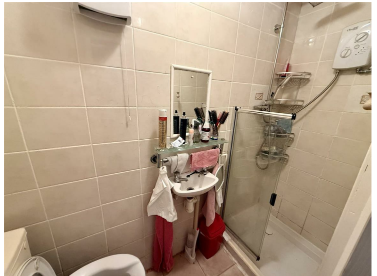
being fully tiled with WC, pedestal wash hand basin & electric shower, tongue & groove ceiling