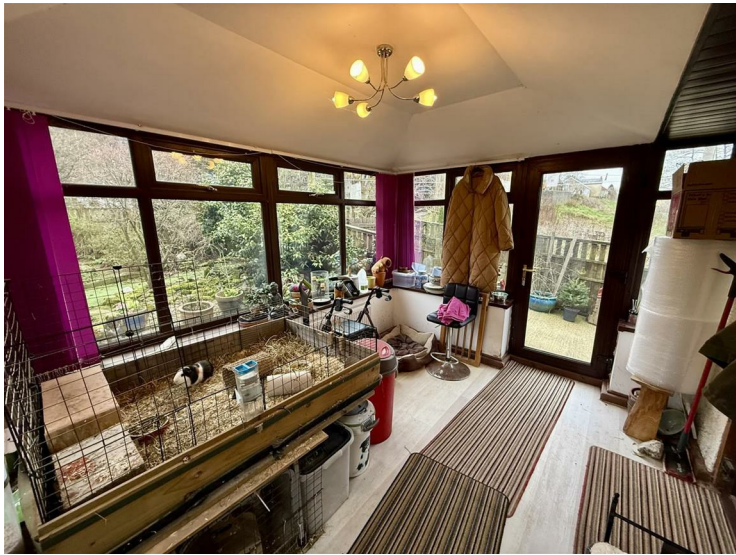
(Of uPVC construction) A great space to soak up the sun & overlook the garden.