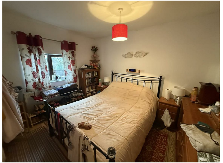
with rear view & -